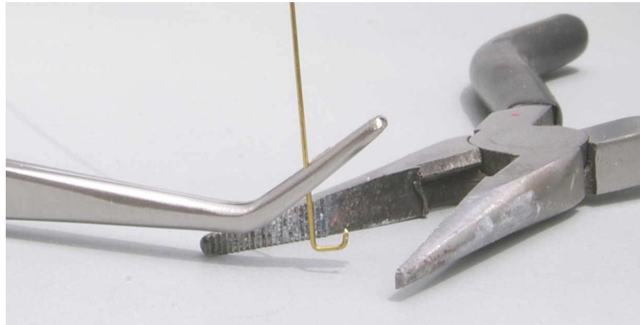
Brass rod bent to form a trailer hitch

Small needle nose pliers can be used to bend the brass rod