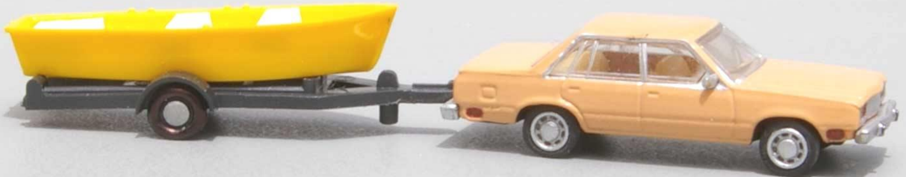
Atlas Ford Fairmont with Wiking boat trailer