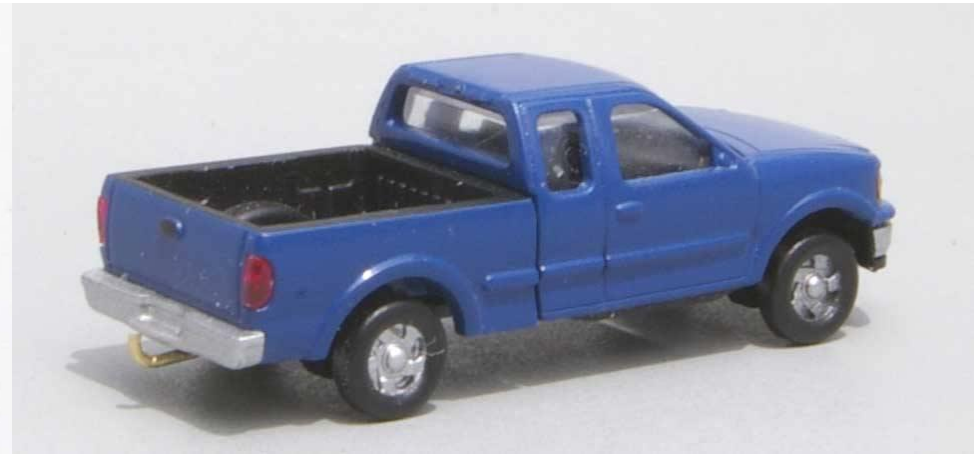
Trailer hitch installed on Atlas Ford F-150