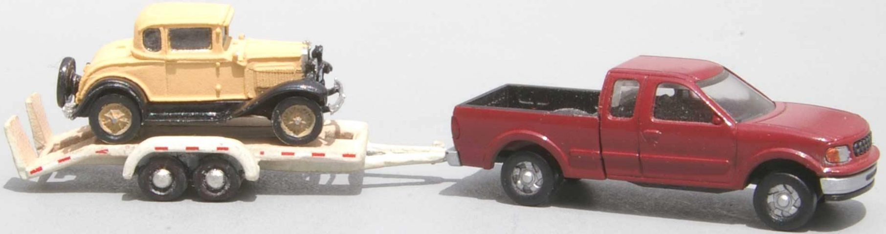
Atlas F-150 with Dmented tandem axle trailer and GHQ Ford Model A