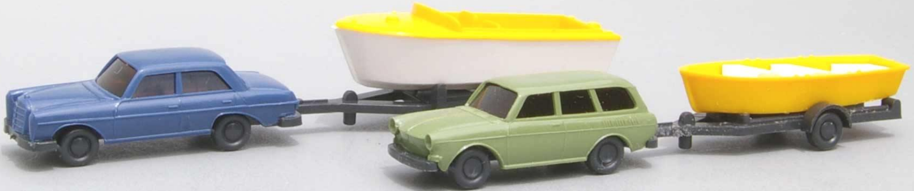
Wiking Mercedes-Benz and Volkswagen with boat trailers as delivered