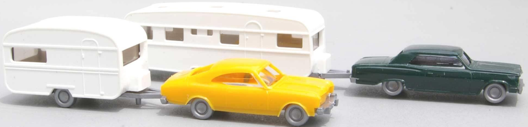
Wiking Opel and Chevelle with travel trailers as delivered