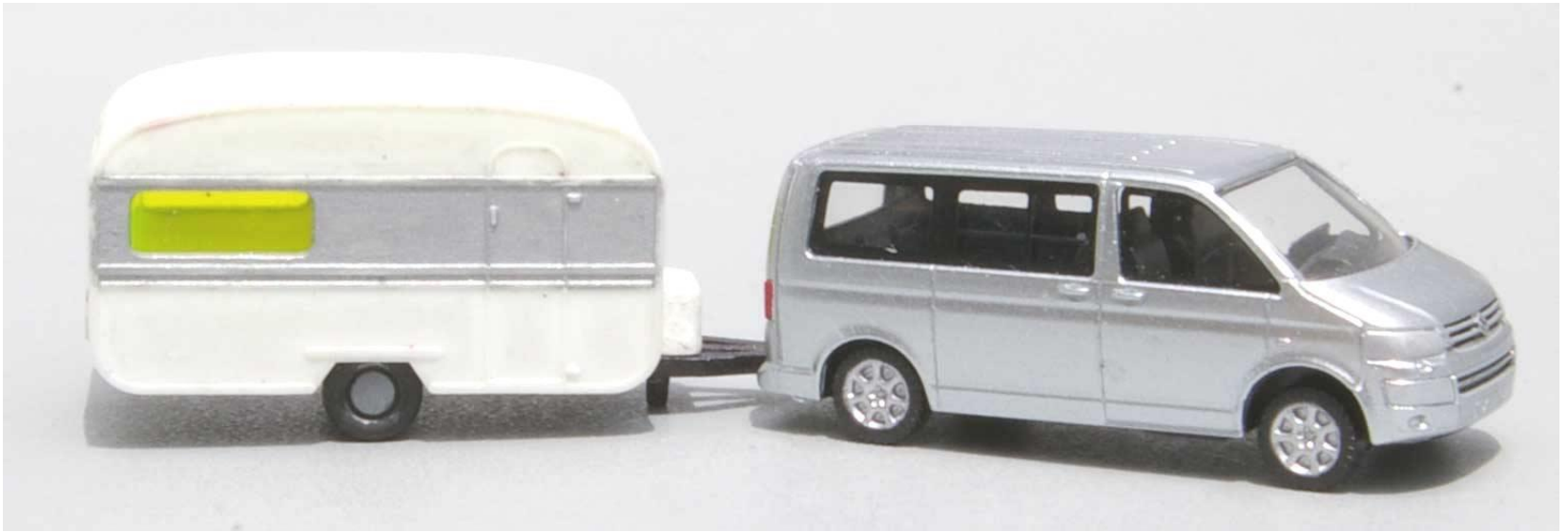
Wiking Volkswagen T5 with Wiking travel trailer