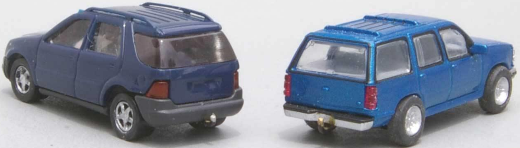
Busch Mercedes-Benz M Class and Atlas Ford Explorer with the trailer hitches installed (A dab of silver paint on the ML hitch makes it look more like a chrome ball.)