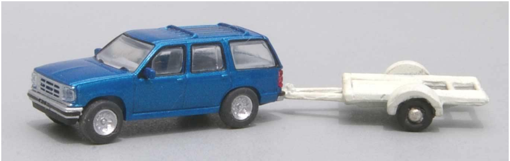
Atlas Ford Explorer with Dmented single axle trailer