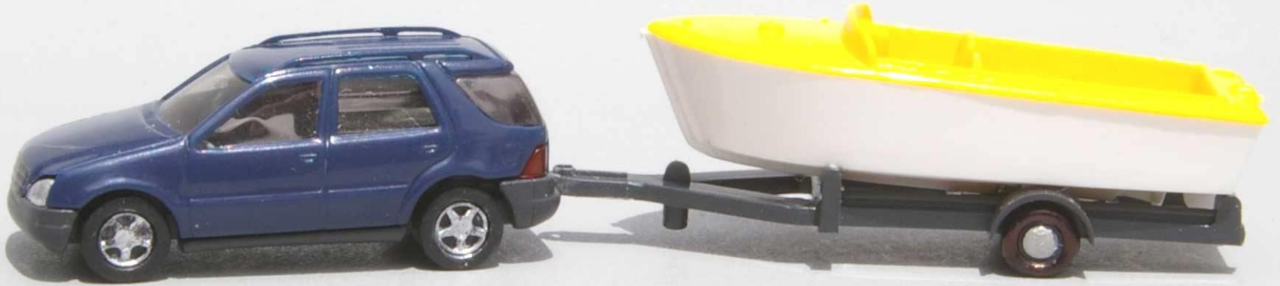
Busch Mercedes-Benz M Class with Wiking boat trailer